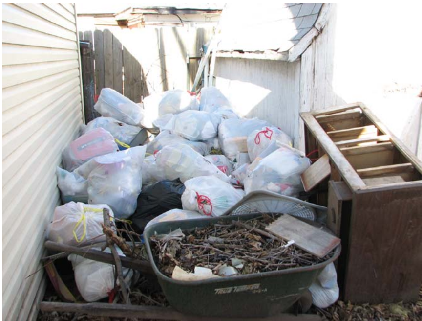
5006 S. Elmhurst – January 16, 2014