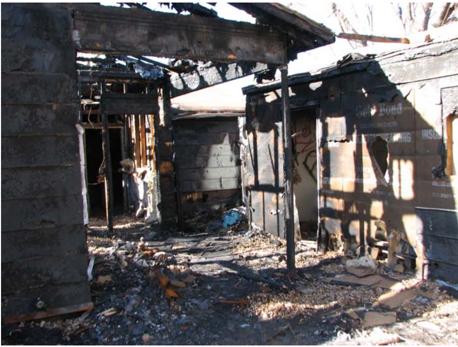
5006 S. Elmhurst – January 16, 2014